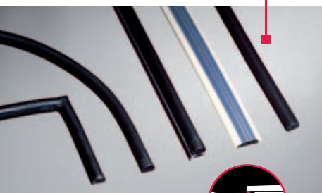
Miniature Safety Edges