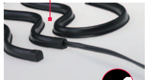
Miniature Safety Edges