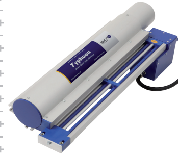
Typhoon with P-Sh-N-Ex anti-static bar