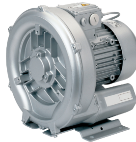
Powerfull but compact blower for the Typhoon airknife. Supplies filtered air to the airknife