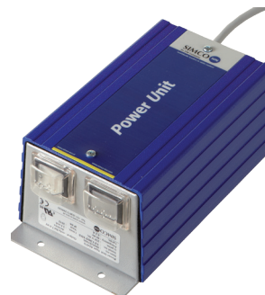
A2A7M Power Unit with 12V connection for the pressure sensor

An optional airpressure sensor can measure the air pressure inside the airknife. If the pressure drops under the required level, the system does not work optimal. A system check is then neccessary, often it appears that the air filter needs to be cleaned.