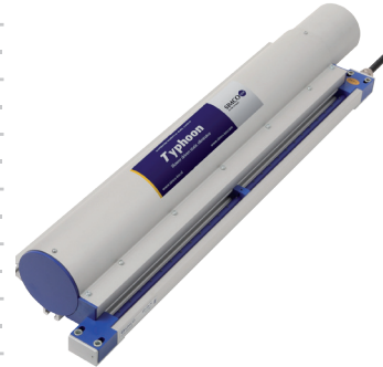
Typhoon with EP-Sh-N anti-static bar