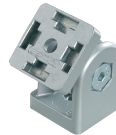
Optional mounting hinges for Typhoon airknife